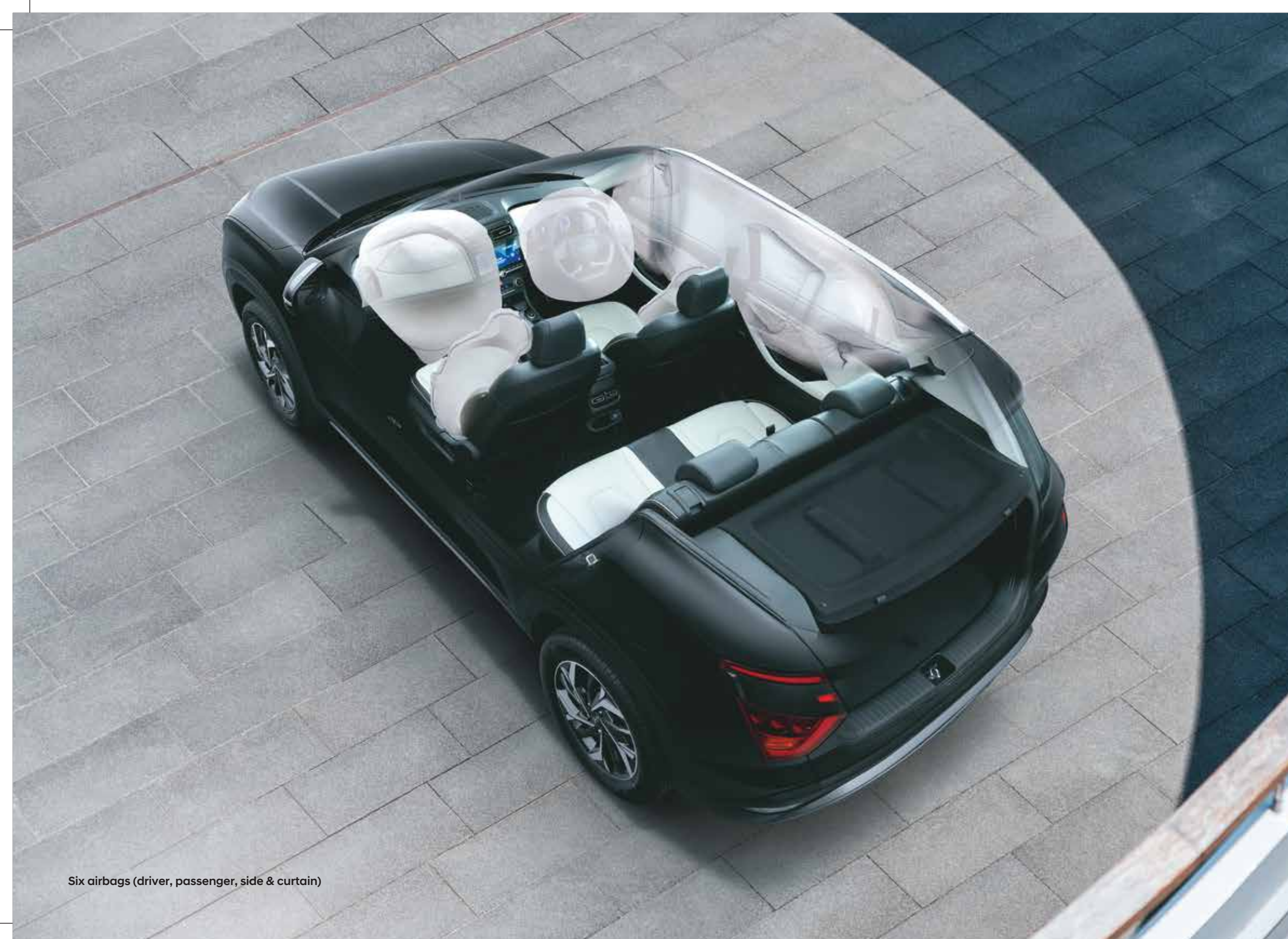
Six airbags (driver, passenger, side & curtain)