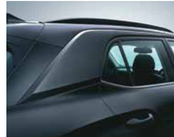
Black gloss C-pillar garnish