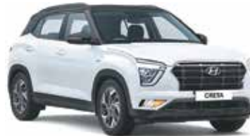
Atlas white with abyss black roof