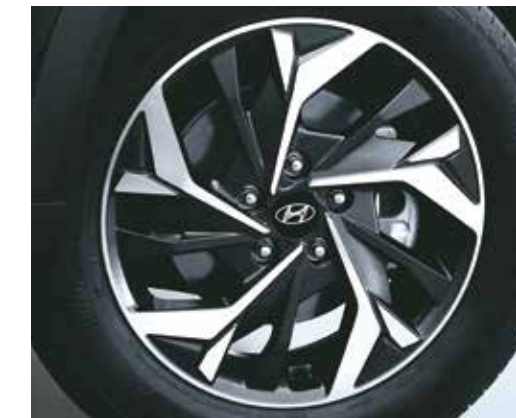
All wheel disc brakes