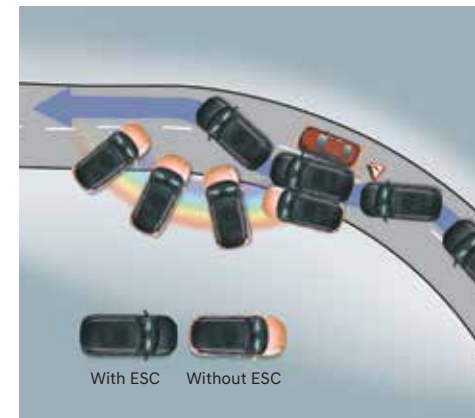
Electronic stability control (ESC)