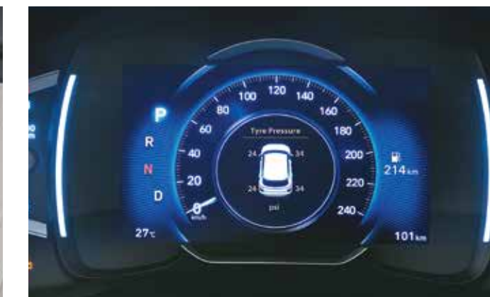
Tyre pressure monitoring system: Highline

Other standard safety features: Rear parking sensors | Speed alert system | Impact sensing auto door unlock | Speed sensing auto door lock | ESS