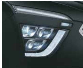
Trio beam LED headlamps with crescent glow LED DRLs