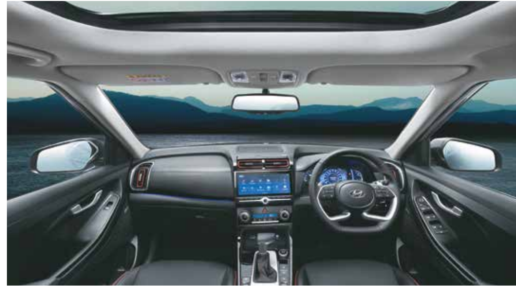
All-black interiors with coloured inserts - Available in Knight edition