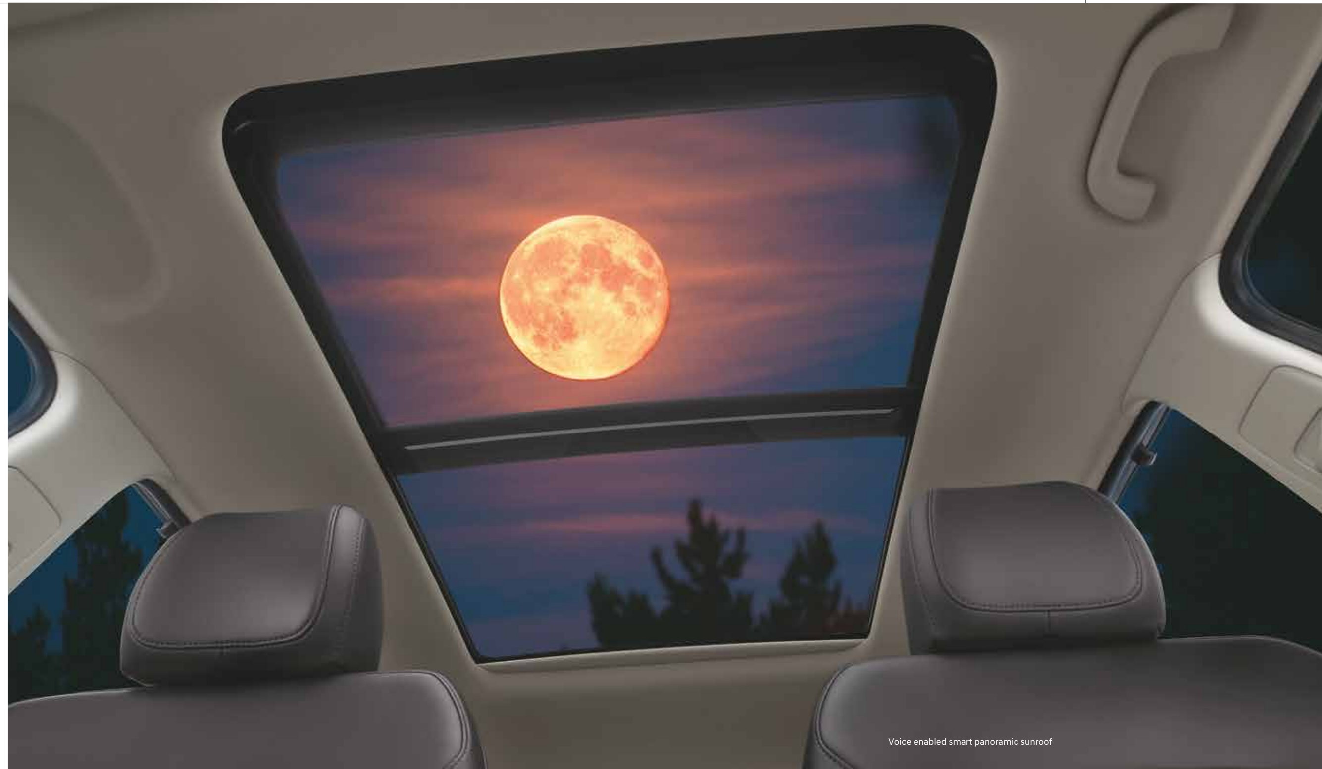
Voice enabled smart panoramic sunroof