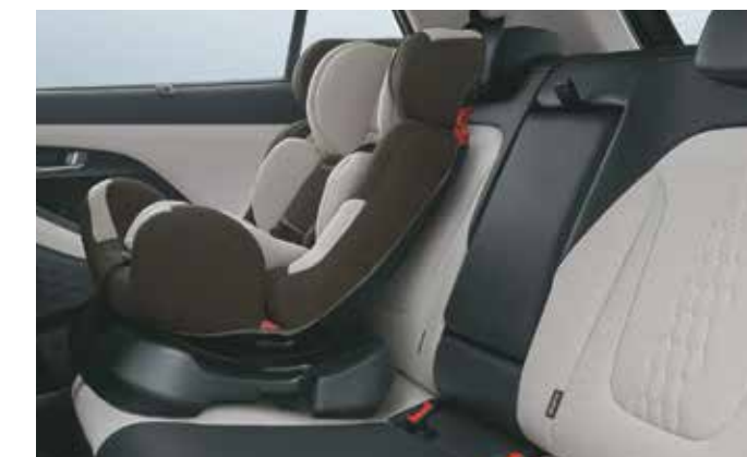
Child seat anchor (ISOFIX)