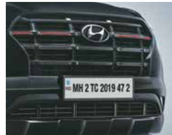
Black gloss radiator grille with red insert

With a breathtakingly beautiful and edgy design, Hyundai Creta has been crafted to command respect. The bold exterior and the new masculine stance will set you apart from every other SUV on the road. No matter where you decide to go, Hyundai Creta will help you stay one step ahead on the road.