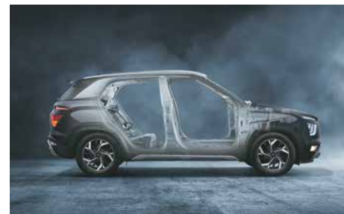
Strong body structure with AHSS