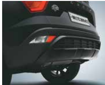
Black gloss front and rear skid plate