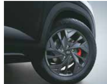
Red front brake caliper