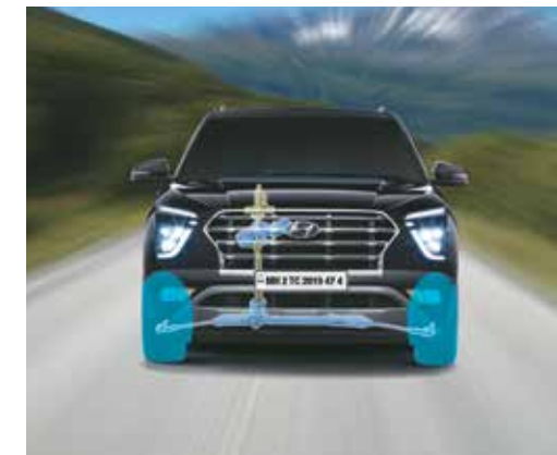
Vehicle stability management (VSM)