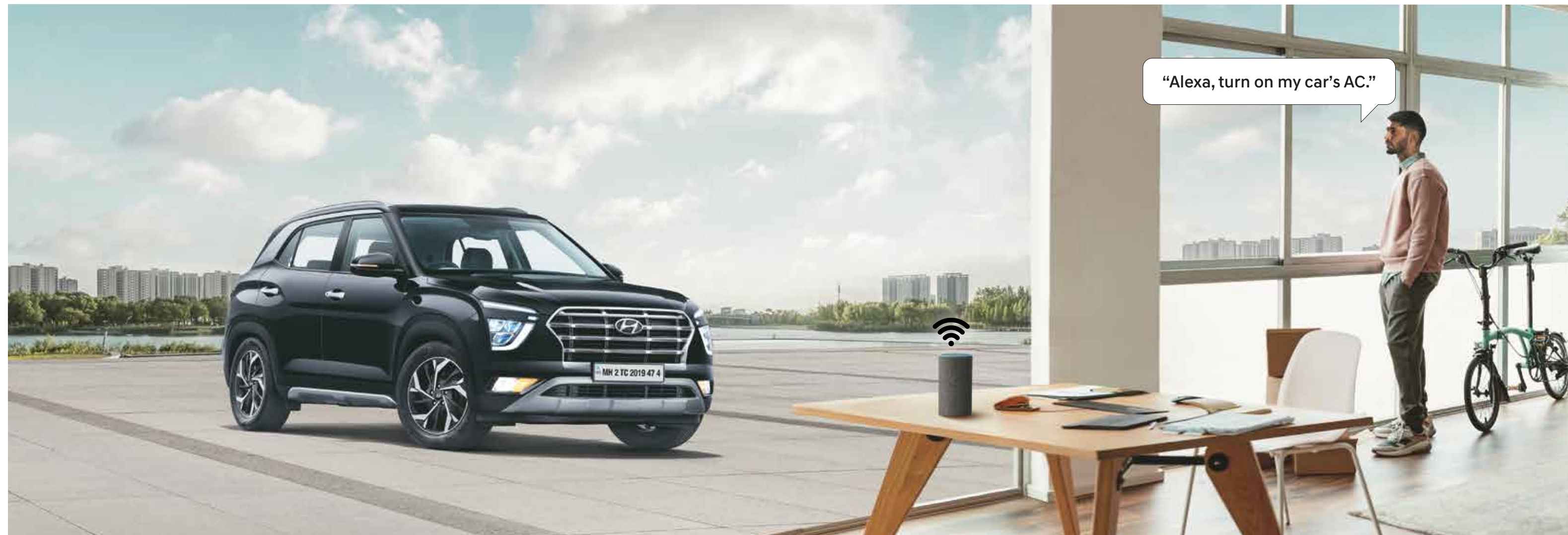
Home-to-car (H2C) with Alexa^