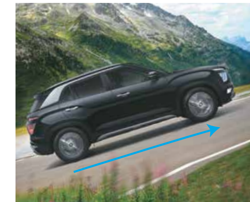
Hill start assist control (HAC)