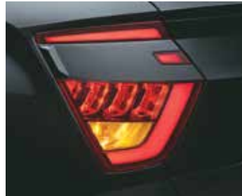
LED tail lamps

Other features: Body colour outside door handles | Abyss black shark fin antenna | Black gloss roof rails and outside rear view mirror