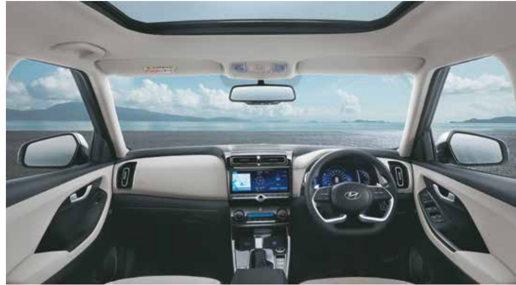
Two tone black & greige interiors - Available in standard CRETA